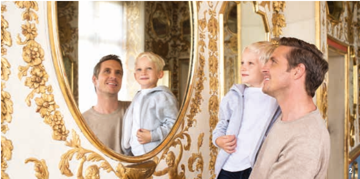
👑🌿 The Hall of Mirrors offers interesting views for young and old alike

The first palace on the site—the old corps de logis—was constructed from 1704 onward. It was initially intended to serve as a hunting lodge for Duke Eberhard Ludwig. In 1718, however, when Ludwigsburg became the Duke’s principal place of residence, he sought a more fitting reflection of his power and prestige. Donato Giuseppe Frisoni, who was responsible for the construction of the palace, also developed the plans for a new corps de logis to the south. As a result, the three-wing complex acquired a fourth wing, creating a square. The impressive structure was completed in 1733.