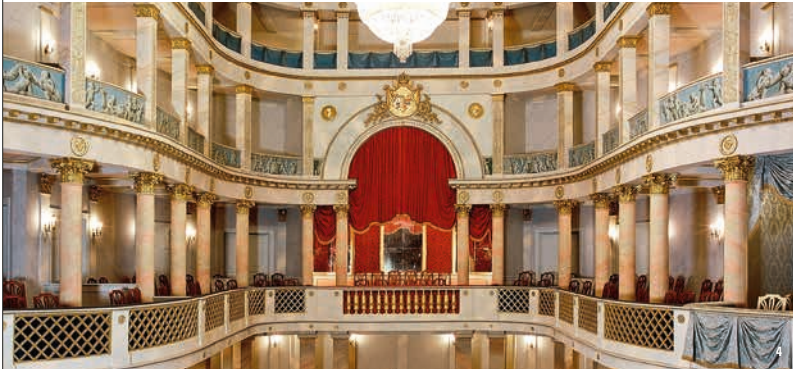
👑🌿 In Ludwigsburg, you can admire the oldest palace theater in Europe, with original stage machinery

A walk through the palace’s grand rooms is time travel in style: The magnificent interiors offer a glimpse of life in the Baroque, Rococo and Neoclassical eras . In these authentic period surroundings, imbued with a subtle sense of faded glory, you can relive the days when Ludwigsburg was a regal residence and the center of the duchy of Württemberg.