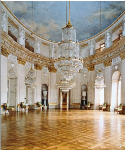
👑🌿 Flooded with light, the Marble Hall encapsulates the splendour of the royal court of Württemberg

A walk through the palace’s grand rooms is time travel in style: The magnificent interiors offer a glimpse of life in the Baroque, Rococo and Neoclassical eras . In these authentic period surroundings, imbued with a subtle sense of faded glory, you can relive the days when Ludwigsburg was a regal residence and the center of the duchy of Württemberg.